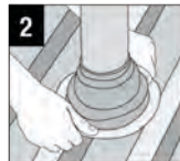
2 Slide over pipe