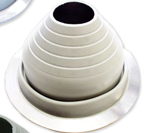
Light Grey EPDM