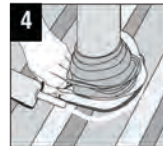
4 Apply sealant