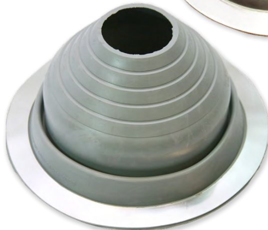
Dark Grey EPDM