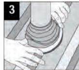
3 Form to roof profile