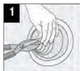
1 Choose pipe opening and trim